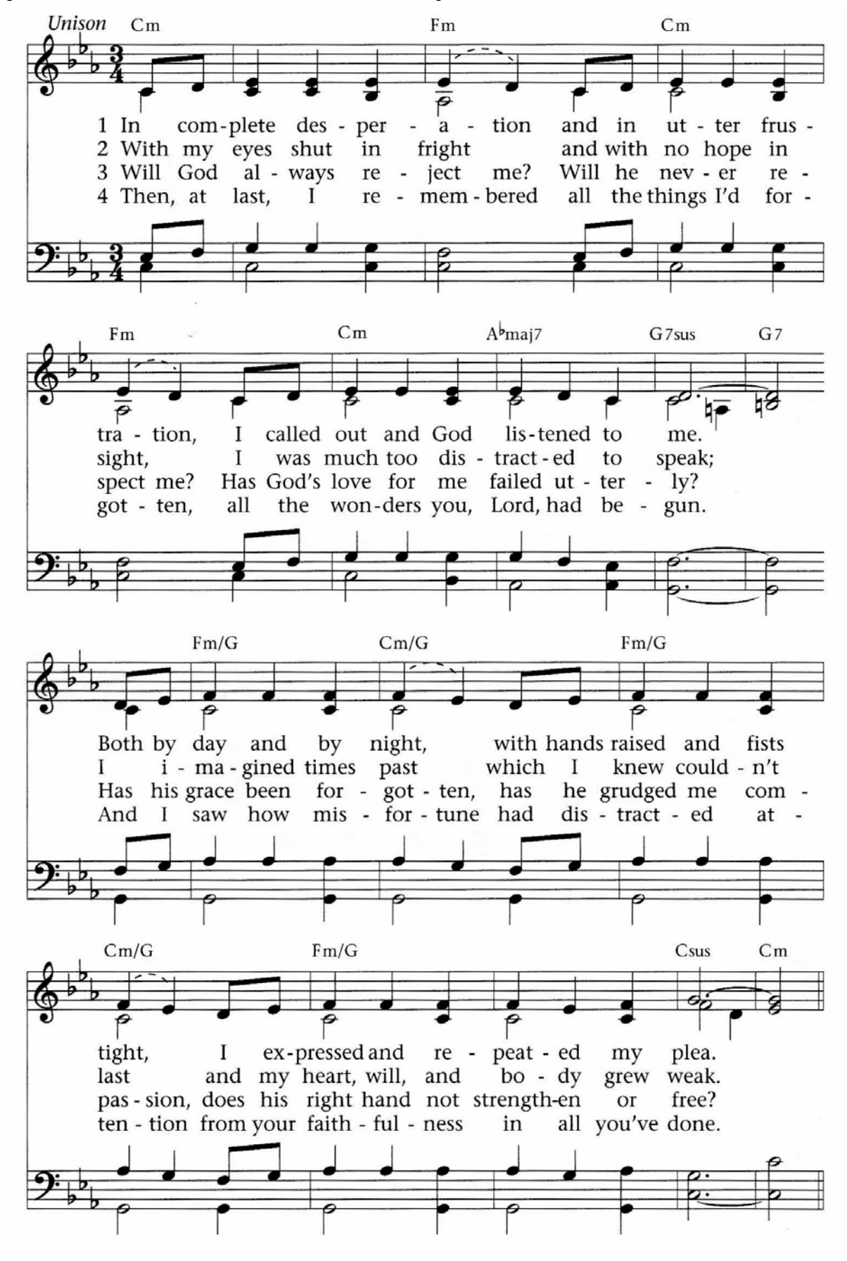
Hymn - I Refused to Be Comforted Easily