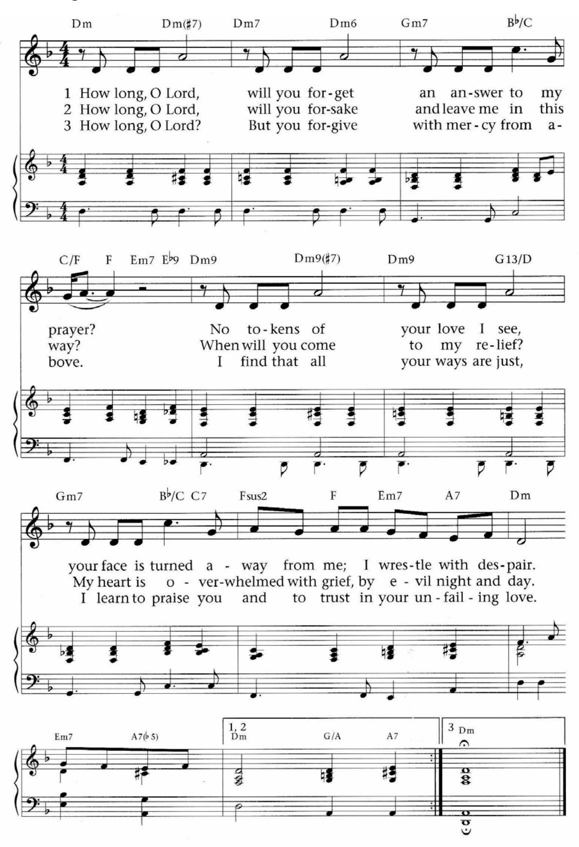
Hymn - How Long, O Lord